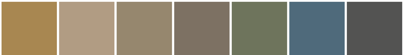
Tuscan Gold JH80-20