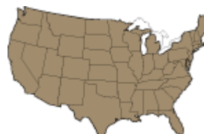
Grand Slate™ shingles are available nationwide.