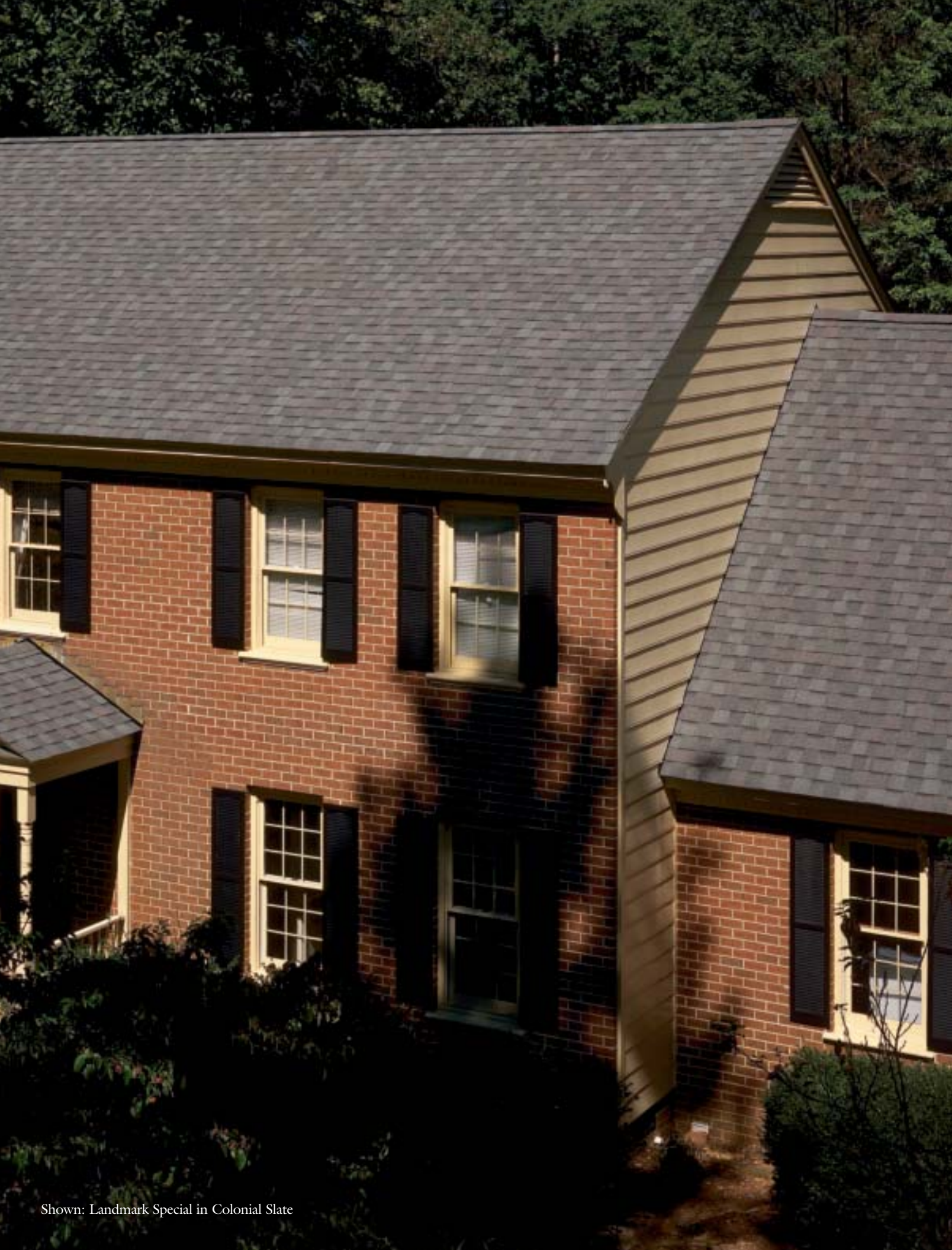
Shown: Landmark Special in Colonial Slate